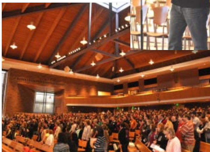
More than 750 leaders gathered for this year's Recharge!