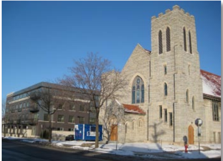
Spring House Ministry Center (above) and Greenleaf Apartments (below).