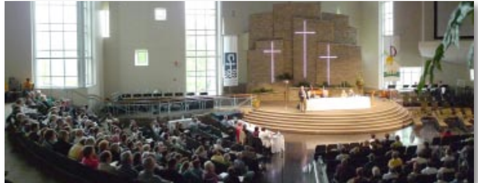
Both worship and business sessions will be held at Shepherd of the Lake Lutheran Church, Prior Lake.