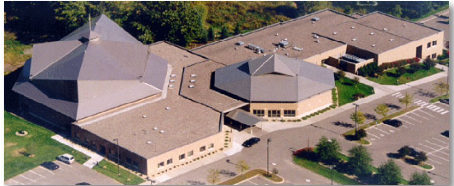
St. Andrew Lutheran Church, Eden Prairie, is the setting for the 2011 Synod Assembly.