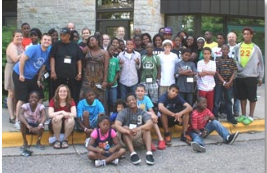
Young people from Redeemer Lutheran Church and Jordan new Life spent three days at Vacation Bible School at St. Olaf College.

classes included piano, art, acting, soccer, capeirora, rapping, poetry, singing and Spanish.