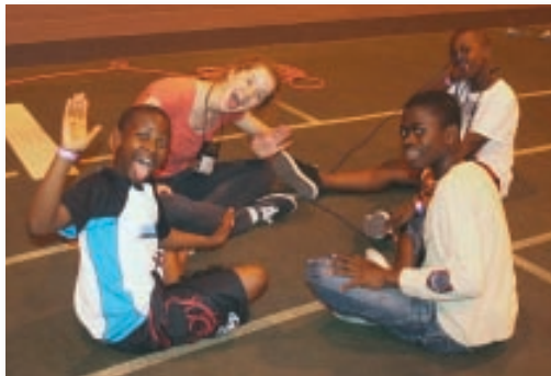
Students selected three classes each day.

As part of the experience, the students chose three classes to attend during the day. This is intended to simulate choosing classes in either high school or college. The